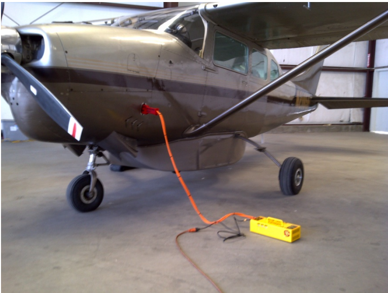
Avwatch C-206 modified with an FAA approved cargo bay area underneath the fuselage of the aircraft. The cargo bay area carried the TASE 200 Gimbal EO/IR sensor.